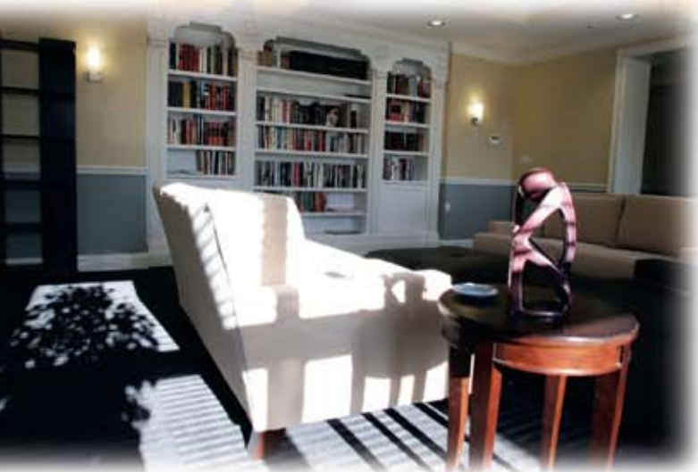
The Esplanade's library is a wonderful place to visit for a quiet read on a rainy day.

The Esplanade offers the type of care-free living you have earned.