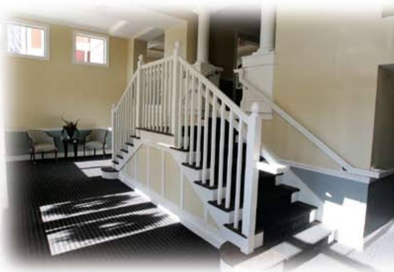
The Esplanade's professionally designed lobbies reflect the same refined living as each of our condominiums.

Cardiovascular and resistance machines will work you out in the Esplanade's fitness center. Plasma screens will entertain you.